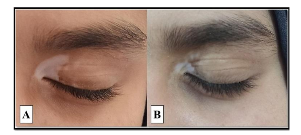
Fig. 5. A) Female patient vitiligo lesion on the left eye lid before treatment with ADSCs/NB-UVB. B) Good improvement at the end of treatment

As regards the site of vitiligo patches, 3 (20.0%) patches were on the trunk, 4 (26.6%) on the extremities, 5 (33.3%) on the acral parts and 3 (20%) patches were on the face. All the patches on the extremities showed excellent response, while all the acrally located lesions showed poor or no responses.