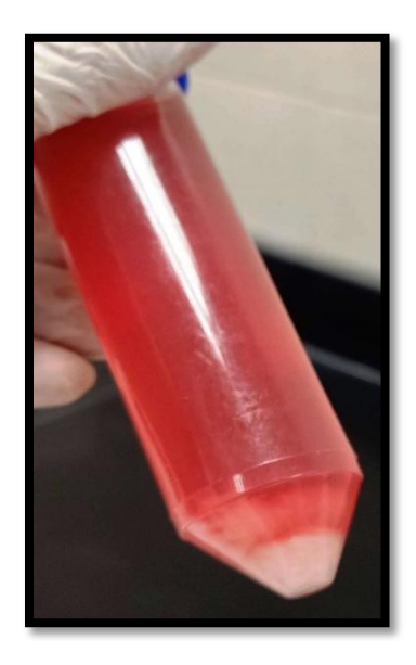
Fig. 3. Pellet formed from centrifugation of (SVF pellet+ DMEM+ FBS+ Penicillin-Streptomycin-Amphotericin B mixture)

Fahmy et al.; JAMMR, 34(23): 539-547, 2022; Article no.JAMMR.94524