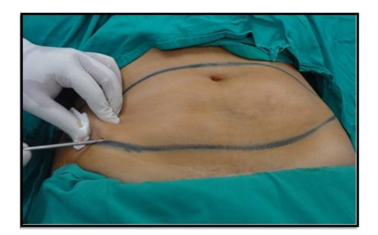
Fig. 1. Insertion of a cannula at the site of incision for injection of tumescent anesthesia