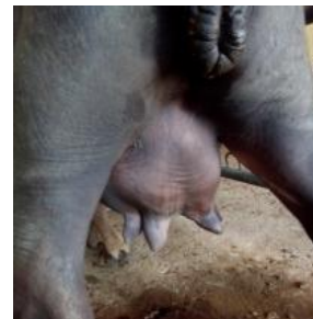
Fig. 3. Mammary glands fully engorged with milk