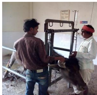
Fig. 8. Buffalo pre-medicated treatment

secured tied separately and site was prepared for aseptic surgery. Local analgesia was induced by infiltration with 2% Lidocaine hydrochloride. The left oblique ventrolateral or left lateral and parallel to milk vein the incisions was made and with precaution oblique abdominal muscle was incised (Fig. 9). Further, peritoneum incised & opened (Fig. 10), the uterus was exteriorized. Later, the incision was made on the greater curvature of uterus avoiding cotyledons (Fig.11). The dead male fetus was removed along with, placenta and four Furea bolus (control the uterine infection- Allopathic remedies, India) were kept inside uterus. Uterine incision was closed by cushioning followed by double row of lembert pattern sutures using chronic catgut no.1#0 (Fig.12), The remaining peritoneum, muscles and sub-cutis layers were closed by continuous lock-stich pattern using chronic catgut no.2#0; then lastly skin layer was closed by horizontal mattress sutures pattern using cotton