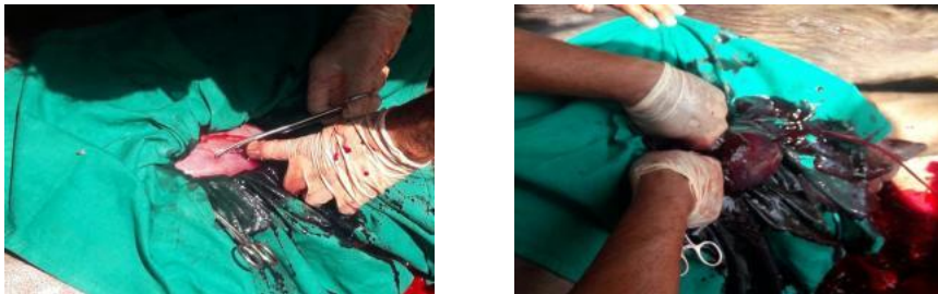
Fig. 11. The exteoration of uterus, uterine amniotic cavity and its wall was incised in longitudinal fashion at greater curvature avoiding cotyledons