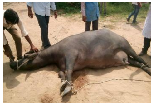
Fig. 5. Restraining the buffalo in right lateral recumbency