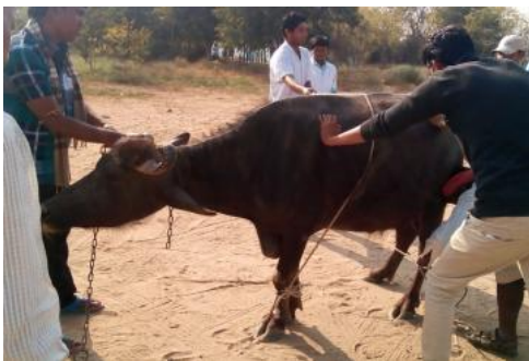
Fig. 4. Restraining the buffalo by holding fore limbs and hind limbs of buffalo