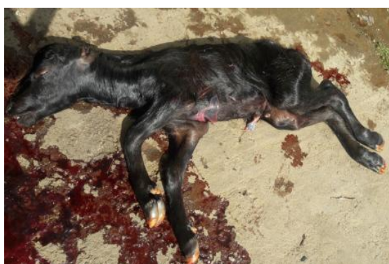
Fig-14: Delivered dead large size male fetus