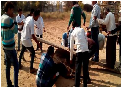
Fig. 6. Placing the plank over the abdomen