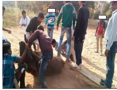
Fig. 7. Rotation of animal in clock wise direction