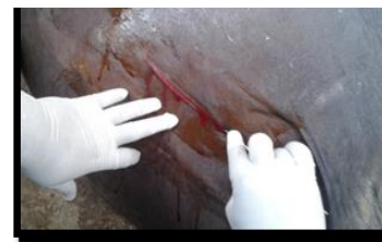
Fig. 9. Aseptic precaution with oblique abdominal incision extending from point of stifle towards umbilicus above 5 cm parallel to milk vein on left side