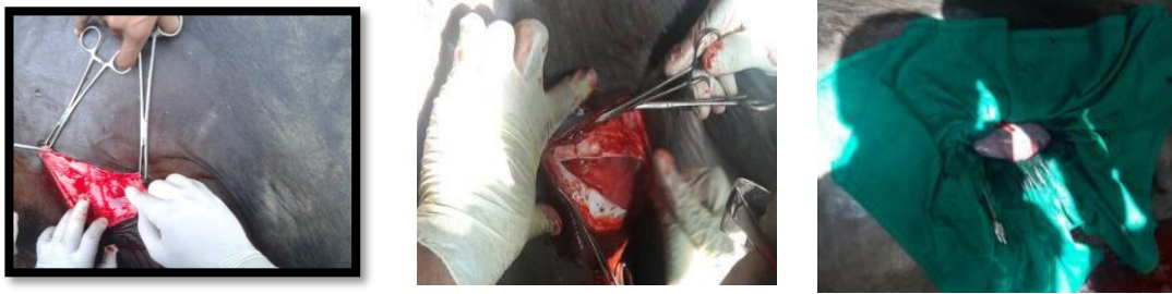
Fig. 10. skin, muscle, peritoneum and uterus were opened by incised in longitudinal fashion