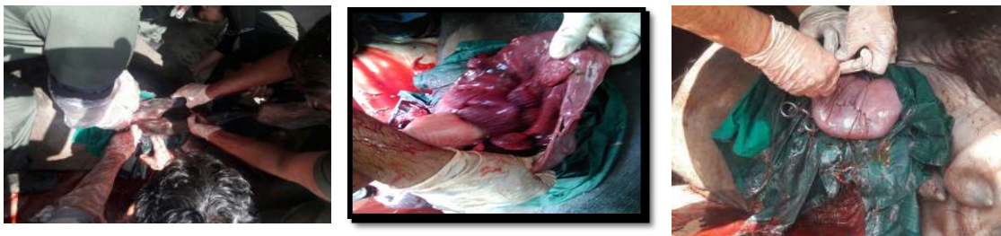
Fig. 12. The dead male fetus was extracted, fluids were drained, placenta removed manually and four furea bolus kept inside uterus and uterine incision was closed by cushioning followed by double row of lembert pattern sutures using chronic catgut no.1#0 .