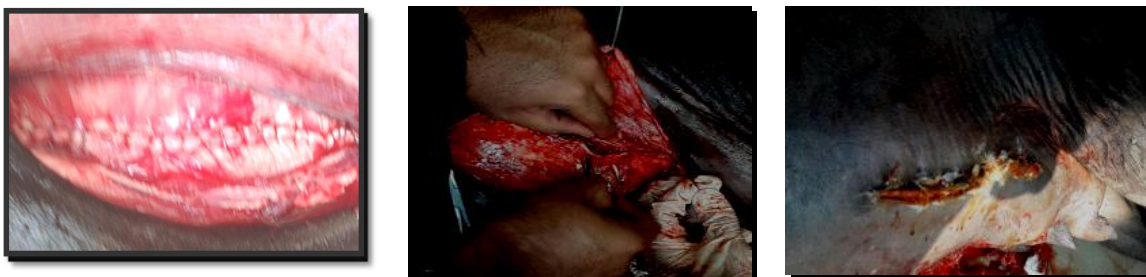
Fig. 13. The remaining peritoneum, muscles and sub-cutis layers were closed by continuous lock-stitch pattern sutures using chronic catgut no.2#0; then lastly skin layer was closed by horizontal mattress pattern sutures using cotton thread non absorbable sutures material.