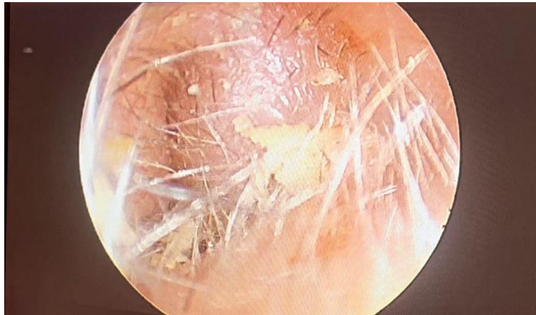
Fig. 1. Image of a well-limited rounded mass fill-up the entire external auditory canal

carcinoma originating from the EAC is extremely uncommon. The salivary glands, oral cavity, palate, nasal cavity, and nasopharynx are typically home to ACC of the head and neck [2].