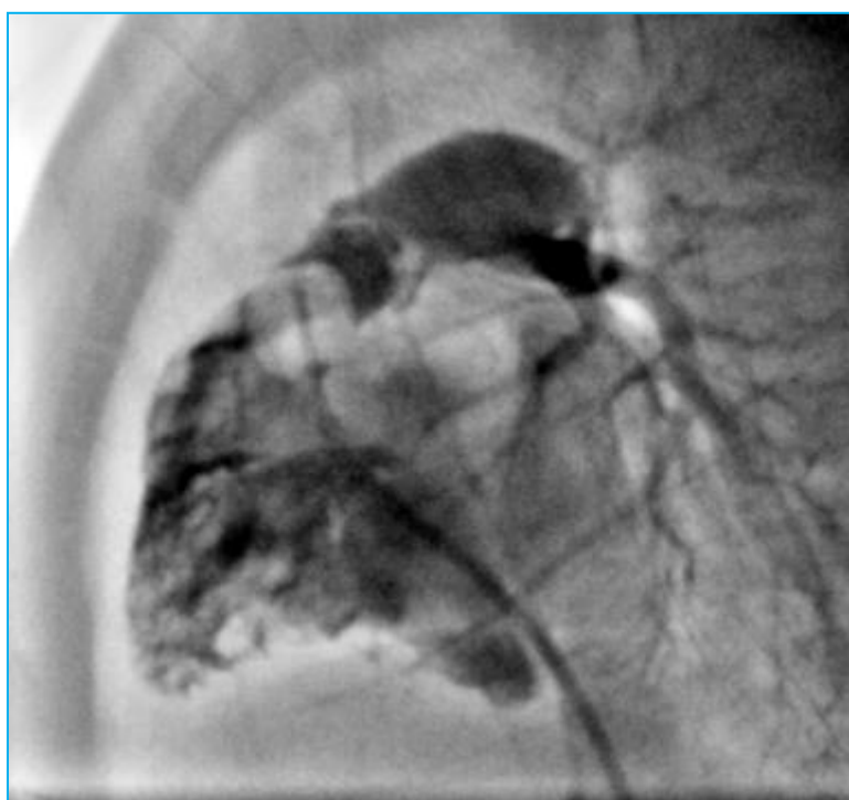
Fig. 1. RV angiogram at lateral view showed systolic diming of pulmonary valve

outcome were collected from patient record file. The right ventricle function, severity of tricuspid and pulmonary regurgitation (PR), residual pulmonary stenosis and intra-atrial shunts in the ASD/PFO levels were evaluated post BPV and subsequently 1 and 6 months afterward in the outpatient follow-up.