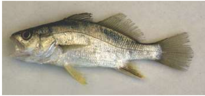
Fig. 2. Bobo croaker fish ( Pseudotolithus elongatus ) from Lower Buguma Creek