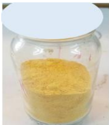
Fig. 1a. Bleached powder