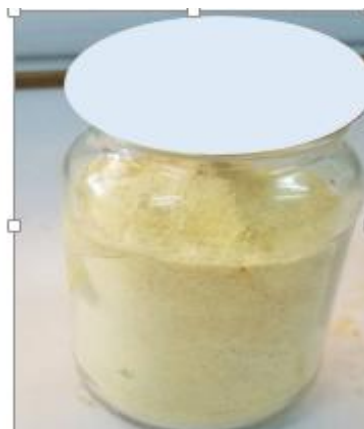
Fig. 1b. Unbleached powder