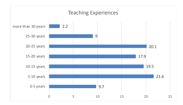
Fig. 3. Teaching experiences

Furthermore, leaders who can inspire their staff to remain dedicated to the school's mission will contribute to its overall success. This is due to the fact that transformational leaders have been shown to have a direct impact on student achievement. These leaders are characterized by a combination of vision, inspiration, courage, risk-taking, and introspection [15]. Since teachers at four government schools rated the behaviour of the principal as having the highest teacherlead (TL) perception, this finding may be helpful for the government schools in the Chukha district of Phuentsholing Municipality in maintaining their viability and fostering the development of more talented and inventive youth in Bhutan's key industrial sectors.