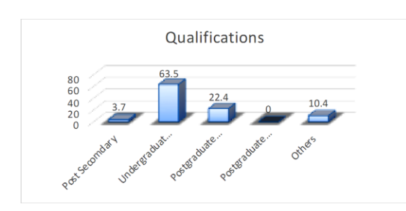
Fig. 2. Qualification