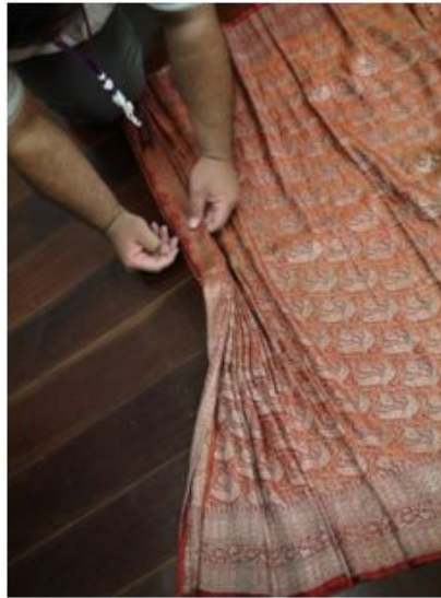
Figure 1. Crimping of the pa nung

Step Two: The actor puts on sanab plao with the arched curves at the bottom hem in the centre of the shin, just below the knee. Ankle bracelets are worn and accompanying ankle rings worn below them ( Figure 2 ).