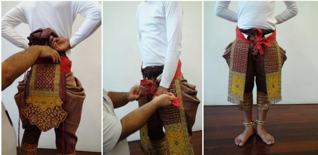
Figure 17. Application of the ogre's bid gon and hoy kang

The ogre's siraporn includes a face mask (Figure 18).