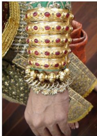
Figure 10. Arm accessories for the hero

Step Thirteen: Accessories are added to the costume. A pendant is worn around the neck, sitting in the centre of the chest. An ornamental belt is fastened around the waist, with its head in line with the pendant. Decorative vambraces are worn on the wrists, as are beaded bracelets and a bracelet of rings or waen rawb (Figure 10). A sangwan is then placed over the head of the performer. This is an ornamental set of crossed braces at the front and back. It is customary for the actor to make a wai gesture by placing their palms together in front of their head before wearing the sangwan .