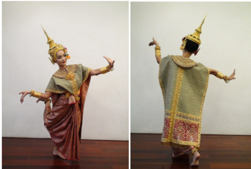
Figure 16. The fully dressed heroine, front and back

Step Twelve: The siraporn is placed on the head of the performer to complete the costume (Figure 16).