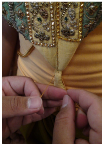
Figure 14. The pa-hom nang being stitched together at the front of the heroine

Step Five: The pa-hom nang is stitched to the inner shirt at the front of the performer (Figure 14).