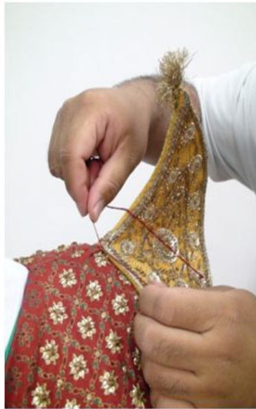
Figure 9. Stitching the inthorn-tanu into place

Step Twelve: The krong kaw , similar to an Egyptian usekh, is attached to decorate the performer's neck area.