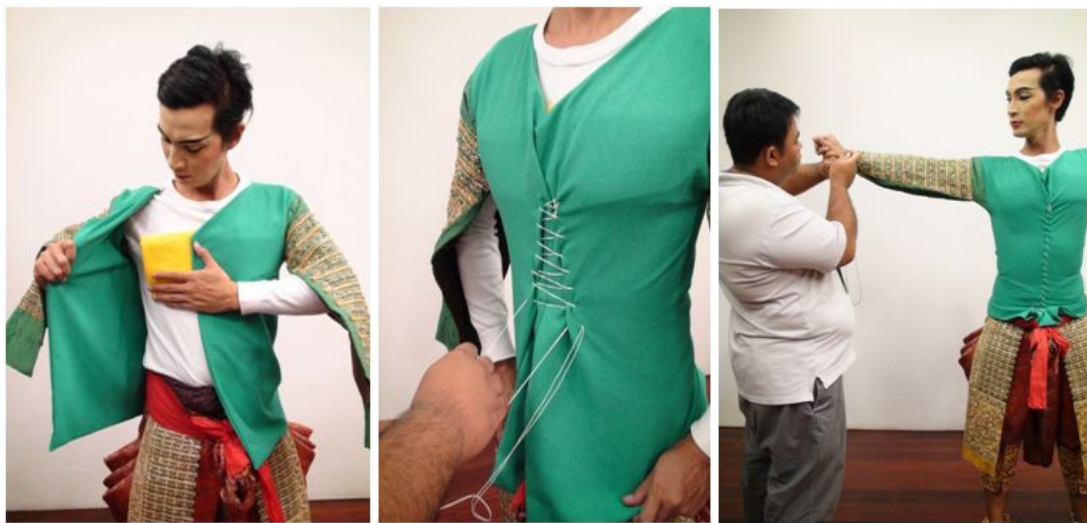
Figure 6. Traditional embroidery to attach the inner shirt to the hero

Step Six: The performers must wear padding to exaggerate their chest and more closely resemble Thai sculptures. The inner padding is placed over a vest or t-shirt and stitched under the performer's undershirt with thick zigzag stitching. The sleeves are also stitched while the performer wears the shirt ( Figure 6 ).