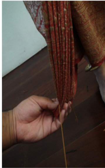
Figure 15. A costume artist helping the heroine to wear the pa nung

Step Eleven: An ornamental belt is fastened around the waist, a pendant is worn around the neck and decorative vambraces, beaded bracelets and waen rawb are worn on the wrists in the same style as the hero.