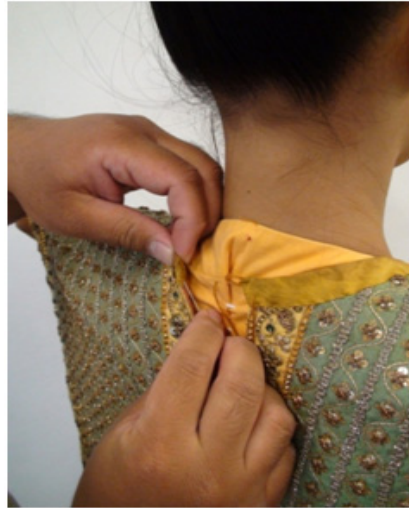
Figure 13. The pa-hom nang being stitched together at the back of the heroine

Step Five: The pa-hom nang is stitched to the inner shirt at the front of the performer (Figure 14).