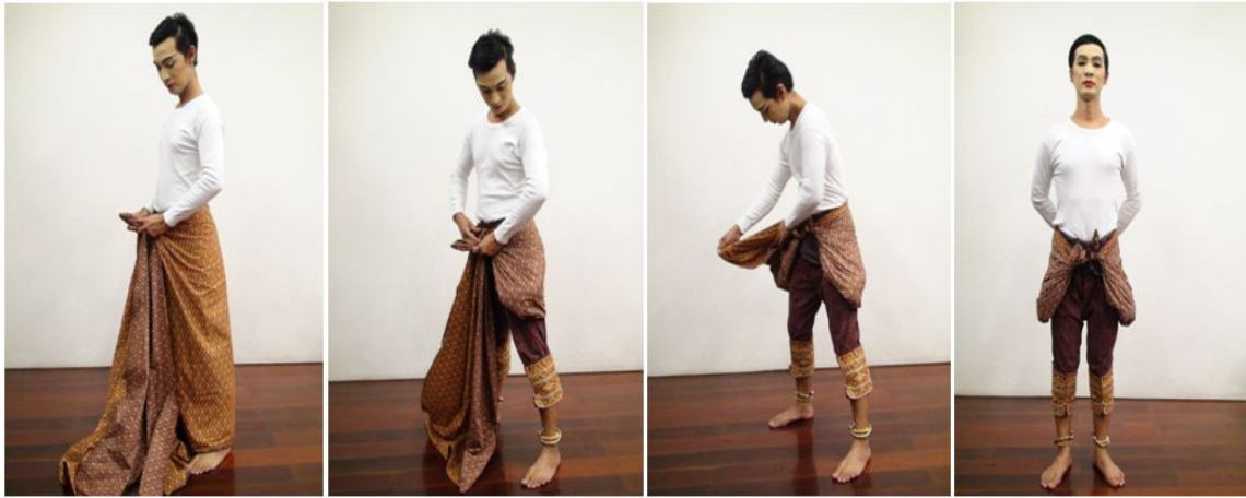
Figure 3. The hero wearing the pa pawk

Step Four: The pre-stitched pa nung is wrapped around the performer by a costume artist. The artist will triple-pleat the pa nung at the back of the performer, wrap the excess fabric around the front and draw it through the performer's legs to the back again, where it will be worn like a loincloth. The actor must also help during this process by holding the fabric tightly in place while it is being crimped and pulled. A piece of plain fabric will be used as a belt to hold the pa nung in place. This fabric is also known as a tail fastener because the pa nung is draped down to create a tail at the back of the performer. If the fabric belt is not fully expanded, it will hurt the hips of the performer. The pa nung is arranged neatly by the costume artist and the belt tied at the front of the performer (Figure 4).