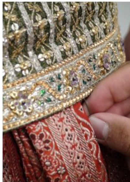
Figure 8. Stitching the radsa-aew to the tail piece

Step Nine: The radsa-aew is stitched to the outfit around the waist using the excess thread attached to the shirt. The fabric is then arranged neatly on the performer and the radsa-aew is stitched into the tail piece (Figure 8).