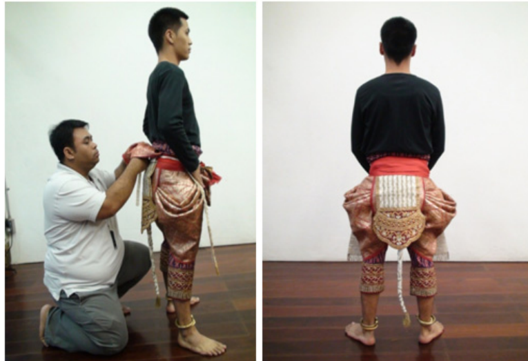
Figure 19. A costume artist attaching the monkey's tail