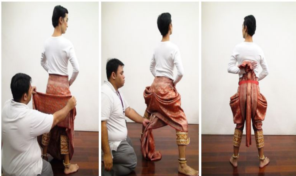
Figure 4. A costume artist helping the performer wear the pa nung

Step Four: The pre-stitched pa nung is wrapped around the performer by a costume artist. The artist will triple-pleat the pa nung at the back of the performer, wrap the excess fabric around the front and draw it through the performer's legs to the back again, where it will be worn like a loincloth. The actor must also help during this process by holding the fabric tightly in place while it is being crimped and pulled. A piece of plain fabric will be used as a belt to hold the pa nung in place. This fabric is also known as a tail fastener because the pa nung is draped down to create a tail at the back of the performer. If the fabric belt is not fully expanded, it will hurt the hips of the performer. The pa nung is arranged neatly by the costume artist and the belt tied at the front of the performer (Figure 4).