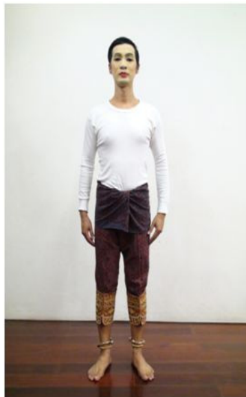
Figure 2. The hero wearing sanab plao , ankle bracelets and ankle rings

Step Two: The actor puts on sanab plao with the arched curves at the bottom hem in the centre of the shin, just below the knee. Ankle bracelets are worn and accompanying ankle rings worn below them ( Figure 2 ).