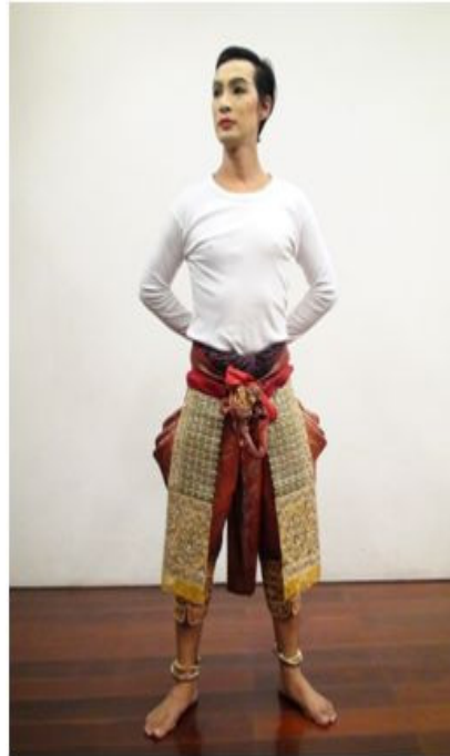
Figure 5. The hero wearing the hoy kang

Step Six: The performers must wear padding to exaggerate their chest and more closely resemble Thai sculptures. The inner padding is placed over a vest or t-shirt and stitched under the performer's undershirt with thick zigzag stitching. The sleeves are also stitched while the performer wears the shirt ( Figure 6 ).