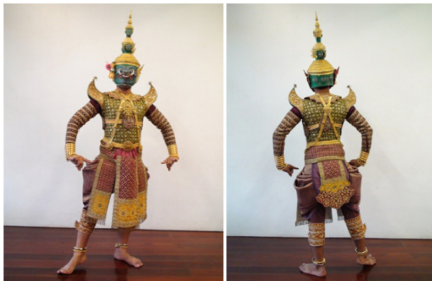
Figure 18A-B. The dressed ogre, front and back

The ogre's siraporn includes a face mask (Figure 18).