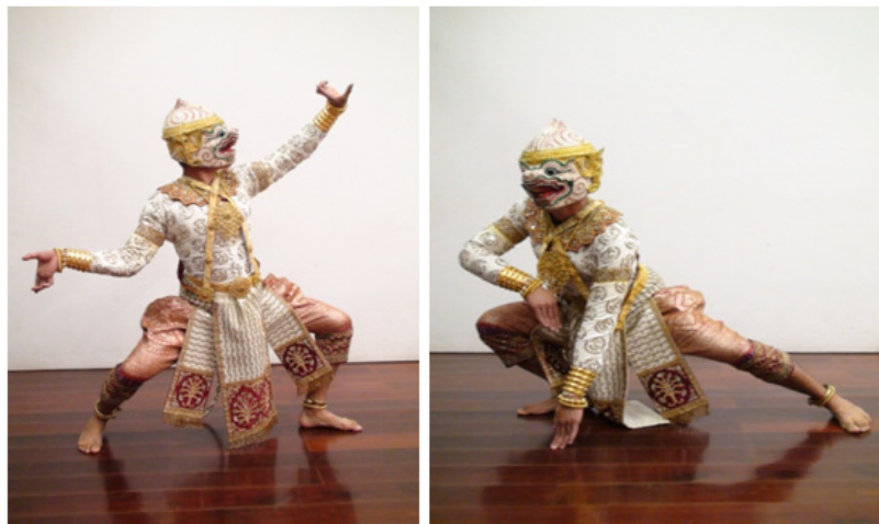
Figure 20. The dressed monkey