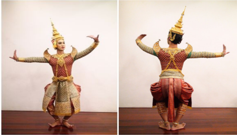
Figure 11. The fully dressed hero, front and back