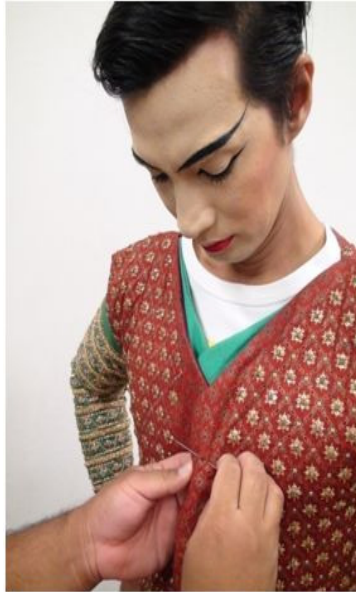
Figure 7. Stitching the outer shirt

Step Nine: The radsa-aew is stitched to the outfit around the waist using the excess thread attached to the shirt. The fabric is then arranged neatly on the performer and the radsa-aew is stitched into the tail piece (Figure 8).