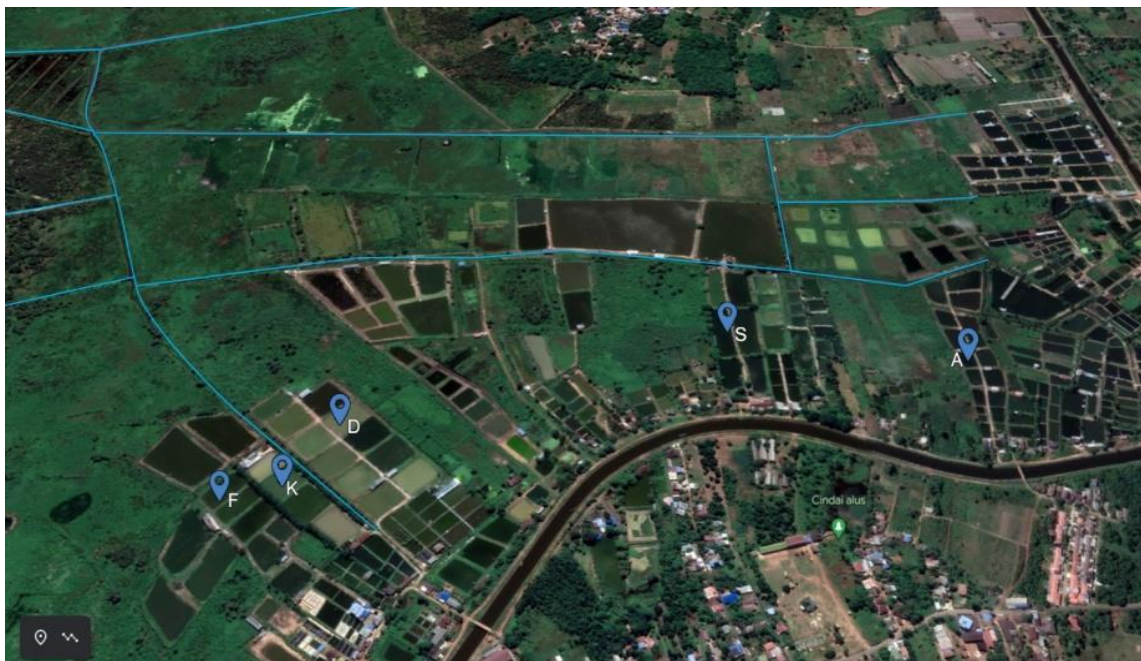
Fig. 2. Geographical Location Map