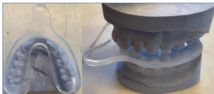
[Table/Fig-2]: Horseshoe shaped Bite Wafer (BW) made in Erkoflex (ethyl-vinyl-acetate).

Pain management: The specific pain management instructions were given to adolescents and parents in each group immediately after the initial archwire placement, including hygiene and standard instructions such as intake of soft diet in the first days and no chewing gum. Adolescents of the control group were allowed to take paracetamol to relieve pain for upto seven days. Adolescents of the test group received a 3 mm thick BW made of Erkoflex (ethyl-vinyl-acetate) and were recommended 20 minutes BW chewing in case of pain and if pain persisted, asked to take oral paracetamol 250 mg [Table/Fig-2]. A notice regarding paracetamol dose (tablet of 250 mg) to take with respect to weight was handed to all participants.