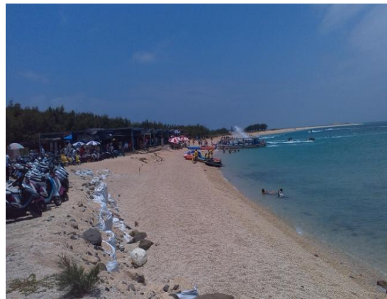
Fig. 3. Various water recreation activities at Jibei beach