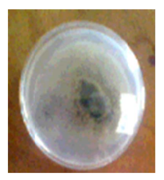
Plate 1a. Mycelia inhibitionof Aspergillus niger by Coriolopsis polyzona extract.

Values are mean of replicates (n = 3). 0.0 = no mycelia inhibition; ACE= acetone extract; MCE= methanol extract. FLU= fluconazole; KET=ketoconazole.