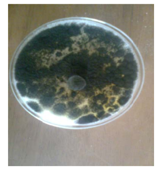
Plate 1b. Negative control.

F. oxysporum and A. niger as shown in Table 5. Table 6 shows the functional groups of bioactive compounds in C. polyzona extracts. The results of FTIR analysis revealed