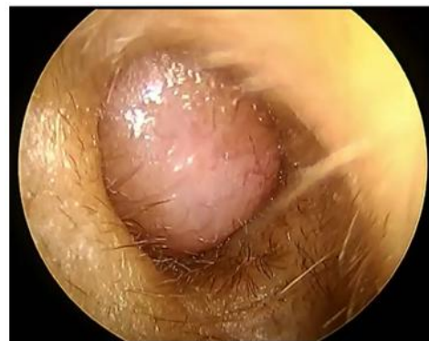
Fig. 2. Otoscopy of the right ear round mass fill-up the entire external auditory canal

As part of an extension assessment, a parotid ultrasound and a chest X-ray were requested, which did not reveal any abnormality. A one-piece resection of the mass was performed with anterior, posterior and internal resections. The post-operative follow-up was simple. The definitive histological examination concluded that there was an adenoid cystic carcinoma of the external auditory meatus with healthy surgical margins and no signs of malignancy at the anterior, posterior and internal resections. The multidisciplinary consultation meeting (RCP) recommended carrying out complementary radiotherapy. The initial hearing result was