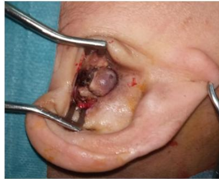
Fig. 1. Image of a well-limited rounded mass fill-up the entire external auditory canal

carcinoma without perineural sheathing or vascular emboli.