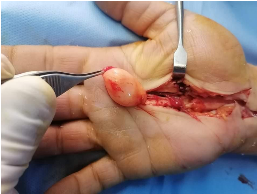
Fig. 4. Intra operative picture showing the conventional incision of carpal tunnel syndrome Extended to the palm and the resected tumor