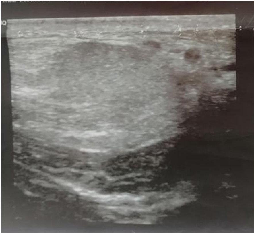
Fig. 2. Ultrasound image of the right hand showing the fusiform mass compressing the deep and superficial flexors of the medius and ring finger and median nerve