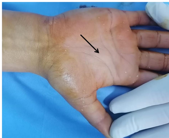
Fig. 1. Pre- operative photo showing palmar swelling of the right hand

Functional exploration by electromyography showed a decrease in the conduction velocity of the median nerve at the wrist and concluded to a sensory carpal tunnel syndrome. Standard radiographs found no abnormalities. Ultrasound of the right hand showed a homogeneous iso echogenic fusiform formation measuring 32 by 13 mm non vascularized, compressing the deep and superficial flexors of the Medius and the median nerve after its division (Fig. 2). MRI showed the presence of a subcutaneous mass opposite the palmar surface of the third metacarpal, oval, well limited, measuring 12x13x27 mm, in homogeneous T1 and T2 hypersignal with a drop in signal after saturation of the fat, not enhanced after injection of gadolinium, it contains a few trabeculae in T2 hypo signal, this mass inuncts between the deep flexor of the right Medius and ring finger and compresses the nerve after its division (Fig. 3).