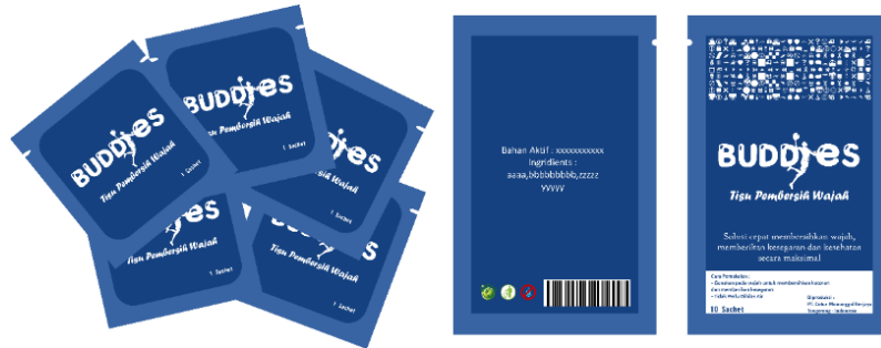
Fig. 3. Illustration of BUDDIES packaging design

adjusted to the predetermined target market. The pricing process also considers the distribution channels used, that are a network of modern stores, online stores and a network of retail stores through retail agents (wholesalers). Sales will be carried out in packs of 10 sachets.