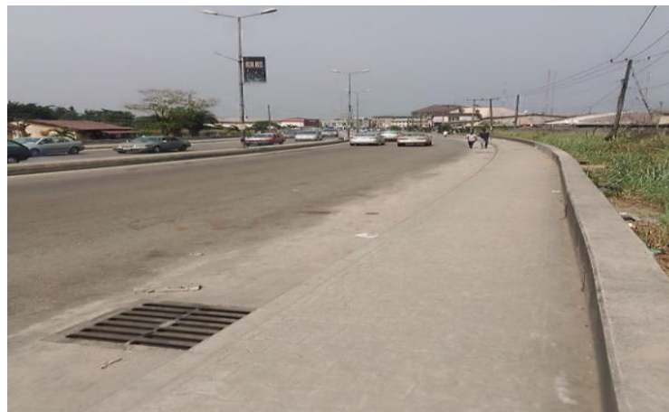
Fig. 2. Trans-Amadi Road, an Improved Road Infrastructure