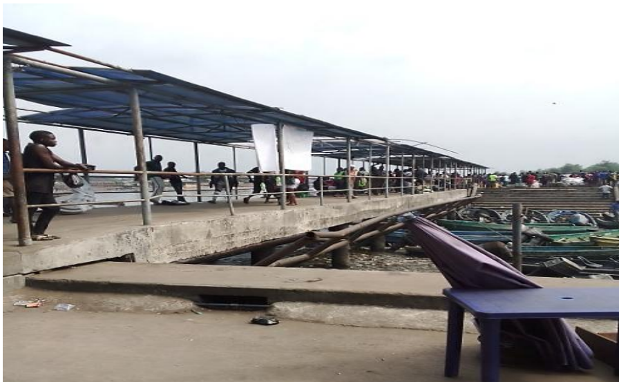
Fig. 4. Bille/Bonny/Nembe Jetty, a Newly Improved Water Transport Infrastructure

From commuters' surveys and observations, there are identified challenges facing the enhancement of the integration of road and water transportation systems in the study area to achieve sustainability in mobility and the urban environment. Thus, Table 7 revealed that the factors responsible for poor integration of road and water transportation in the study area are corruption in government agencies, lack of conformity in the implementation of government policies and programmes, lack of proper land use planning, and poor governance system accounting for 17.3%, 16.3%, 15.2% and 14.4% from the commuters' responses in the distribution. Other factors noted as challenges facing road and water transportation integration are lack of government will, lack of government implementation of the policy on integrated intra urban transport system, and lack of innovative and radical planning approach, the non-adherence to the application of modern planning techniques in the planning of riverine area transport sector as well as lack of modern integrating equipment in road and water transport system representing 13.6%, 12% and 11.4% respectively as presented in Table 7.