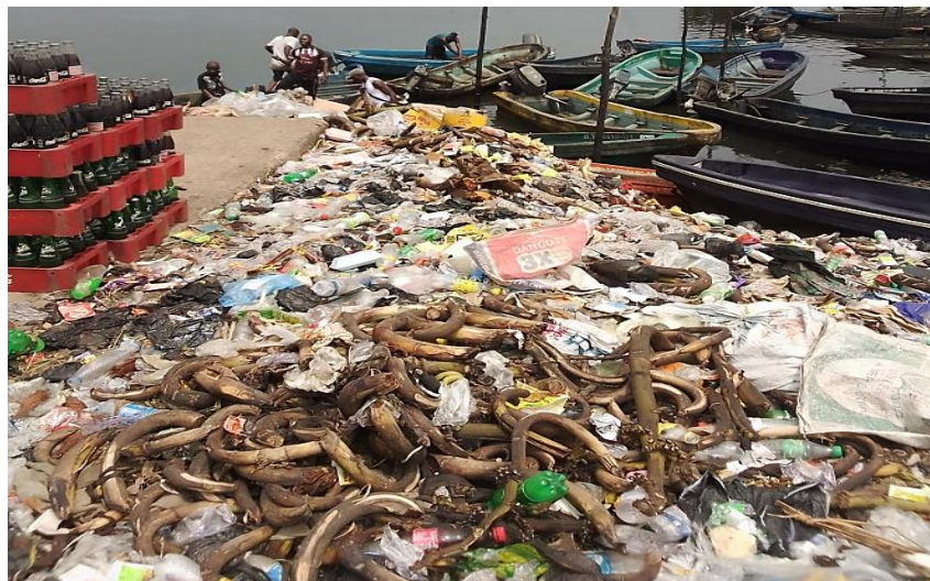
Fig. 3. Feltaco Jetty Iwofe, in a Deplorable Condition