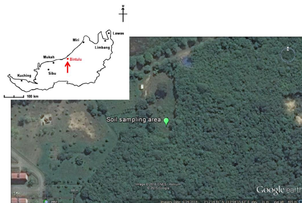
Figure 1. Aerial view showing where the soil used for the sorption studies was taken.

A Typic Paleudults (Bekenu Series) soil located at Universiti Putra Malaysia Bintulu Sarawak Campus, Malaysia (Figure 1) was sampled at 0 to 25 cm, after which the soil was prepared using standard procedures for the sorption studies. Details about the experimental site has been published in one of our papers [24].