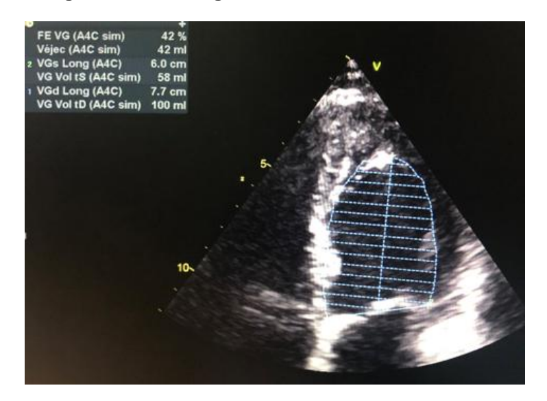
Fig. 3. Ejection fraction of the left ventricule in simpson biplane