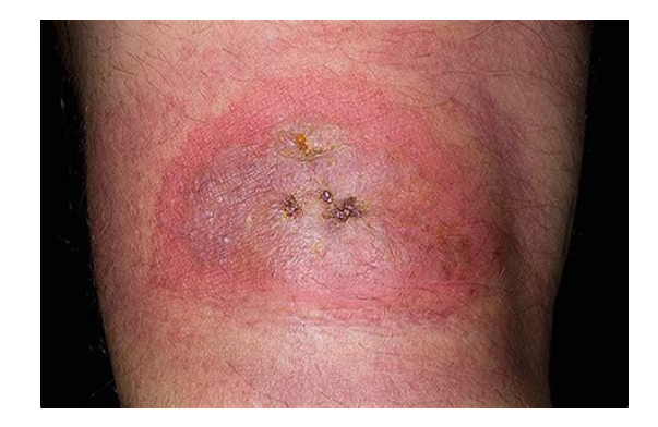
Fig. 1. Erythematous lesion with traces of a scorpion bite on the right knee

The patient was monitored, placed in a halfsitting position, oxygen therapy by high concentration mask at 10l/min, taken from a peripheral venous line, a bolus of 60mg of furosemide was administered urgently then relayed intravenously in a syringe autopusher, two sublingual puffs of nitrates.