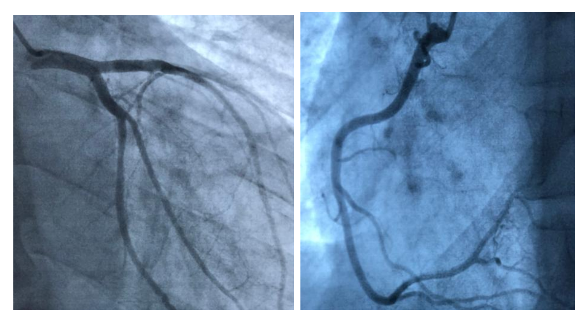
Fig. 4. Normal coronary angiography

According to the D'Abroug classification adopted by the WHO [10], scorpion stings are of 3 types depending on the severity of the lesions, in the case of our patient the bite was classified in class 3 characterized by cardiovascular failure.