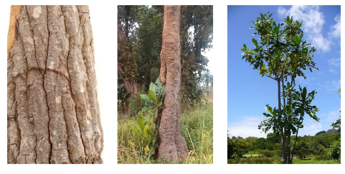
Fig. 1. Images of A. grandiflora trees showing the bark

Samples of fresh Anthocleista grandiflora stem bark were collected in February 2022, at Keana Local Government Area of Nasarawa State, Nigeria. The plant specimen was identified at the Department of Plant Science and Biotechnology Department, Nasarawa State University, Keffi. After due identification, the plant stem bark was sorted to eliminate any dead matter and other unwanted particles and stored for subsequent use. All the chemicals and reagents used were of analytical and GC-grade purity and products of Sigma Aldrich.