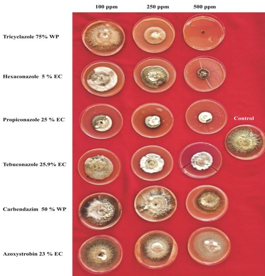
Plate 1. Systemic fungicides on the growth of Alternaria sp.

***Figures in the parenthesis indicates the arcsine transformed values