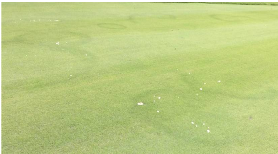
Figure 1. Fairy rings appearing on golf course grass.

(FCs) after the title of the article in Nature that covered our study [8]. Subsequent studies have demonstrated that FCs endogenously exist in all the plants tested, including edible parts of three major cereal crops, rice, wheat, and corn [7]; thus, people have eaten FCs for a long time. Furthermore, FCs increased the yields of rice, wheat, and other crops under field and greenhouse conditions [5,9,10]. These results suggest that FCs are a new family of plant hormones [11,12].