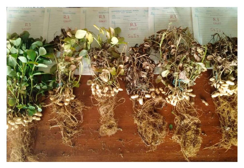
Fig. 1. Arachis hypogea plants at harvest, arranged in order of increasing salinity