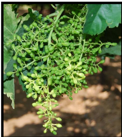
Fig. 3. Berry size: 3-4 mm