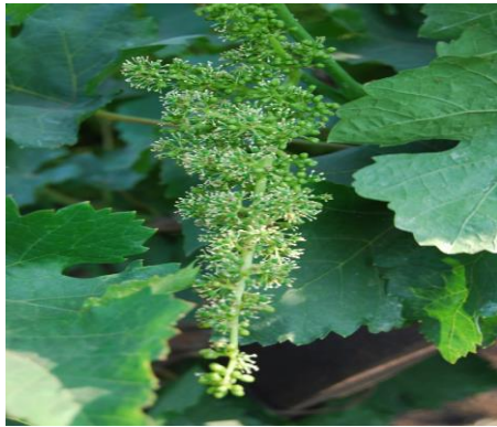
Fig. 2. Stages at 50% Flowering

The growing of the berries and their ripening are the first and second different phases of berry development. Ripening includes a number of coordinated and genetically physiological, biochemical, and developmental processes [23]. Different cultivar of grape having different period of time required for complete development of berry, however, it is possible to anticipate that it will take around 100 days from full blossoming till complete maturity [24].