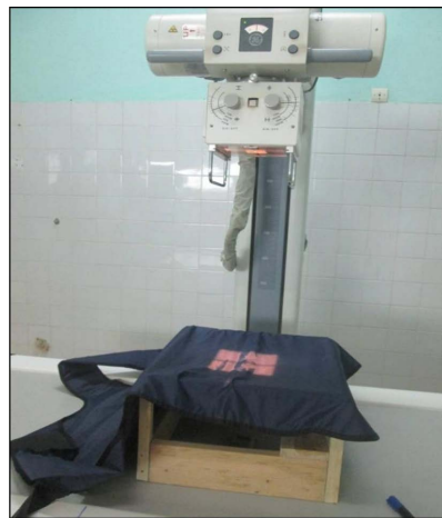
Figure 2. Dose measurement techniques for calculating the lead apron attenuation factor: direct exposure.