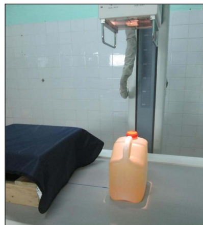
Figure 3. Dose measurement techniques for calculating the lead apron attenuation factor: Indirect exposure (scattered x-rays).