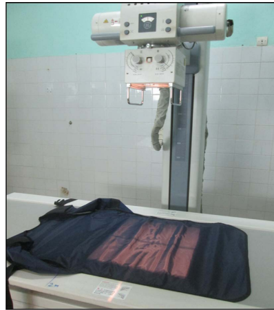
Figure 1. X-ray technique for leaded deck.