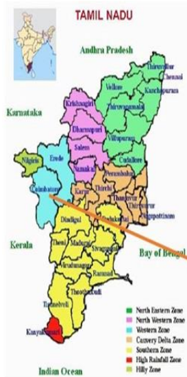
Fig. 1. Map showing study location

Note: The grow (5 kg capacity) bag was selected and filled with top 45 cm soil from the Instructional farm (North) at Karunya Institute of Technology and Science, Coimbatore and the weight / weight basis, to filled the calculated amount of LDPE and recommended dose of fertilizers