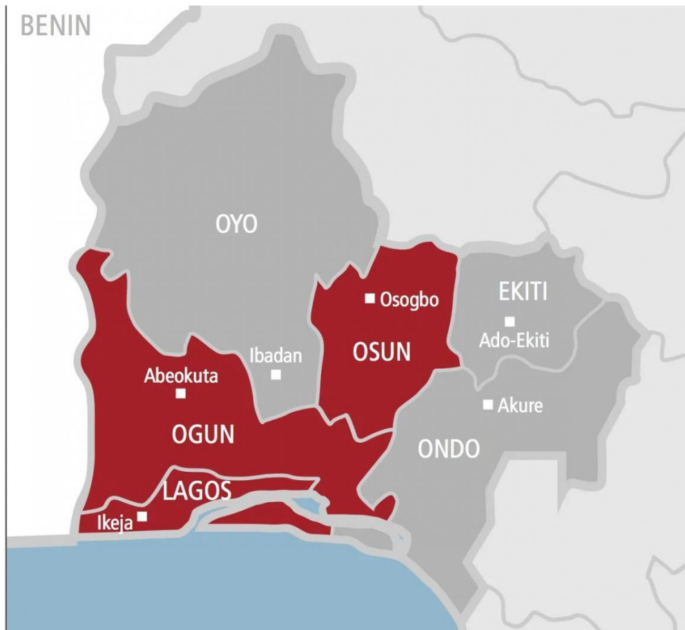
Fig. 1. Map of Southwest Nigeria

A multistage cluster design was employed for this study. In the first stage, four states Ekiti, Osun, Oyo and Lagos were randomly selected from the six states in Southwest Nigeria. In the second stage, ten local governments (5 rural and 5 urban) were selected in each of the four states. In the third stage, four hospitals (2 public and 2 private) were selected in each local government. In the final stage, five healthcare professionals were selected for each hospital. In total, 800 healthcare professionals were enrolled in this study. Participants were selected based on their availability and willingness to participate in the study.