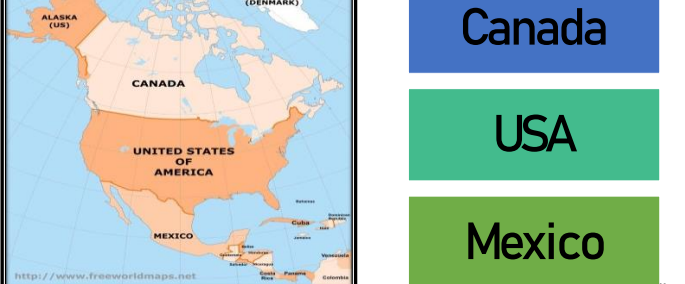
Fig. 1. Countries selected for study in the American Continent