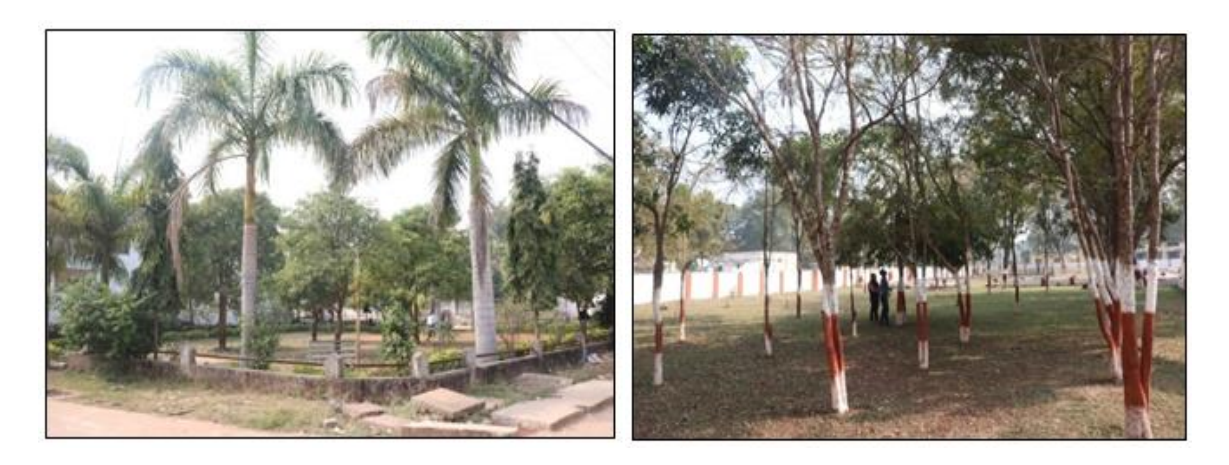
Photo 1. Dwarka City Colony Park-3, Madhav Nagar, Katni; Photo 2. Gandhi Udyan, Opp. South Katni Railway Station, Katni

Based on the higher sequestration potential of carbon stocks in trees, a study was conducted by Ragula and Chandra [20] in Bilaspur district of Chhattisgarh state. Climate and forest types in Chhattisgarh and Madhya Pradesh are closely similar. The study revealed that Delonix regia had the largest amounts of species-specific and CO<sub>2</sub> stocks, followed by biomass Tamarindus indica, Ficus religiosa, Albizia lebbeck, Ficus benghalensis. Azadirachta indica, Peltophorum pterocarpum, Samanea saman and Cassia siamea. In order of highest to the lowest rate of carbon sequestration, the species were sequenced as Delonix regia, Samanea saman, Tamarindus indica, Azadirachta indica, Ficus religiosa, Peltophorum pterocarpum, Albizia lebbeck. Terminalia catappa. Ficus benghalensis, and Terminalia arjuna. In conclusion of their study, they have suggested these tree species are, therefore, that recommended to sequester large amounts of CO<sub>2</sub> from the city and contribute to offsetting warming and mitigating the impact of climate change.