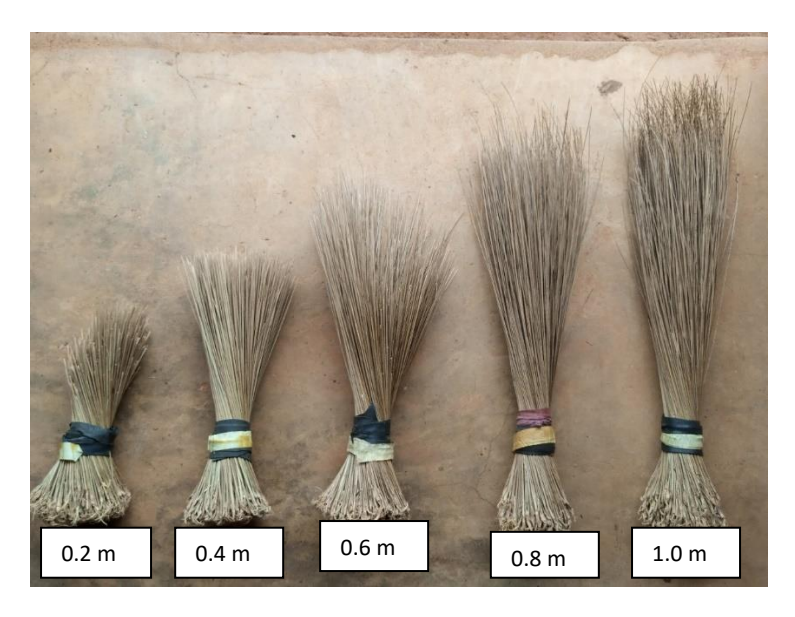
Fig. 3. Oil palm broom length variations used for the output efficiency optimization

Agbo; J. Eng. Res. Rep., vol. 25, no. 10, pp. 110-120, 2023; Article no.JERR.107718