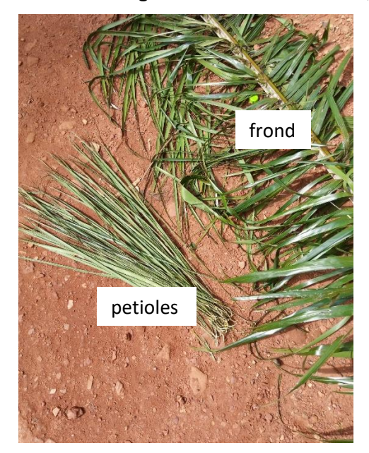
Fig. 2. Extracted palm frond leaf petioles for making broom