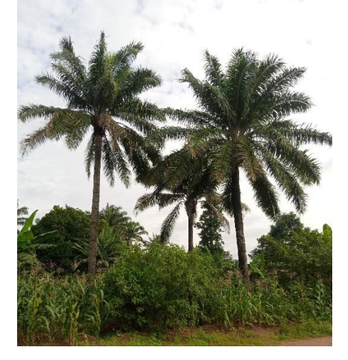
Fig. 1. Palm tree thriving in a farmland in Nsukka, Nigeria

countries. broom arasses (Thvsanolaena maxima) are harvested, dried and attached to sticks for sweeping purposes. The production function is by women and girls that engage in it for economic benefits [13,14]. According to Shackleton and Campbell [15] grass broom production is a means of survival for many low educated downtrodden middle aged and elderly women in the Bushbuckridge municipality of South Africa with an estimated net yearly income of 120 USD and 60 USD for producers and middlemen respectively. Oil palm sweeping brooms are mainly processed from leaves of mature palm trees of up to 10 years to ensure acceptable length and strength (see Figs. 1 and 2).