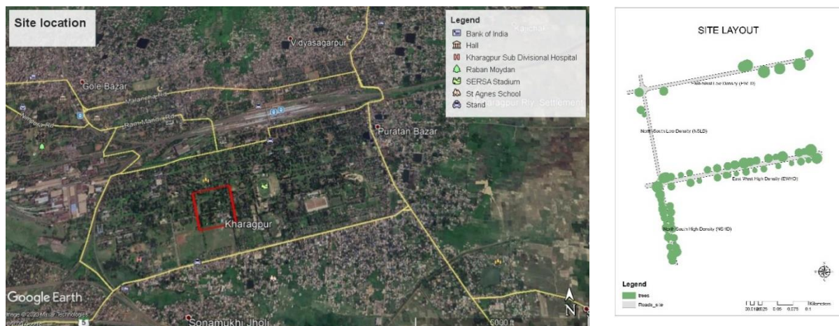
Fig. 1. Site location

Solar parameters were measured at these cross-sections. These parameters were the surface temperature, ambient temperature, and incident solar radiation. The measurements were taken with an infrared thermometer, a thermohygrometer, and a solar power meter, respectively. The readings were taken on either side of the cross-sections, and also at the middle of the road. In the instance where there was a tree present at the side of a cross-section, the readings were taken both, under as well as outside the shade.