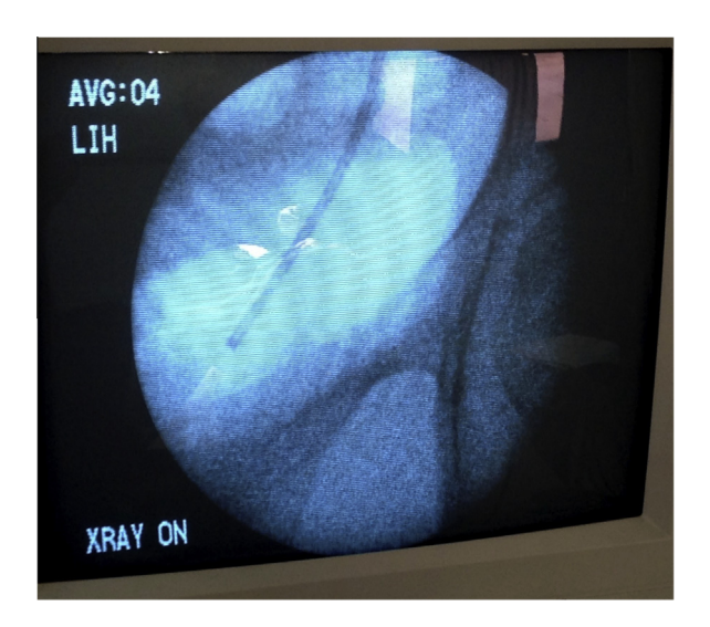
Figure 3 A fluoroscopic image showing the ureteric catheter just above the symphysis pubis.

At the end of the procedure, with the fluoroscope positioned over the bladder, the renal end of the ureteric catheter is grasped and brought out of the Amplatz sheath (Figs. 1 and 2). Under fluoroscopic guidance the ureteric catheter is gradually pulled until the lower end of the ureteric catheter is seen just above the symphysis on fluoroscopy (Fig. 3). A zebra or any other suitable guidewire is passed through the ureteric catheter in an antegrade fashion, until the floppy end of the guidewire is seen to curl in the bladder (Fig. 4). The ure-