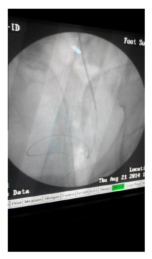
Figure 4 The guidewire being passed through the ureteric catheter allowing it to curl.

At the end of the procedure, with the fluoroscope positioned over the bladder, the renal end of the ureteric catheter is grasped and brought out of the Amplatz sheath (Figs. 1 and 2). Under fluoroscopic guidance the ureteric catheter is gradually pulled until the lower end of the ureteric catheter is seen just above the symphysis on fluoroscopy (Fig. 3). A zebra or any other suitable guidewire is passed through the ureteric catheter in an antegrade fashion, until the floppy end of the guidewire is seen to curl in the bladder (Fig. 4). The ure-