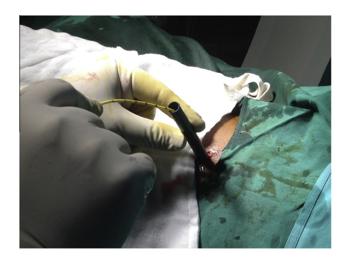
Figure 2 The ureteric catheter being pulled out of the Amplatz sheath under fluoroscopic guidance.