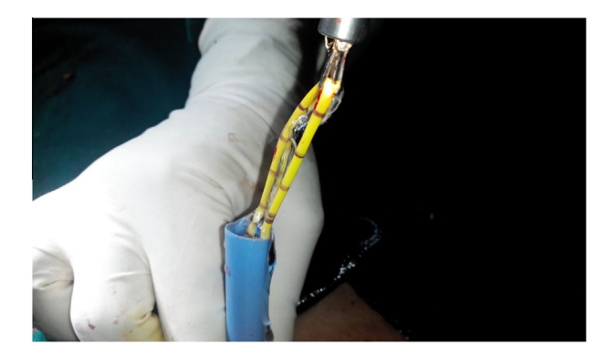
Figure 1 The renal end of the ureteric catheter being retrieved through the Amplatz sheath.

An open-ended ureteric catheter is placed cystoscopically, to opacify the pelvi-calyceal system for the initial puncture, before placing the patient prone.