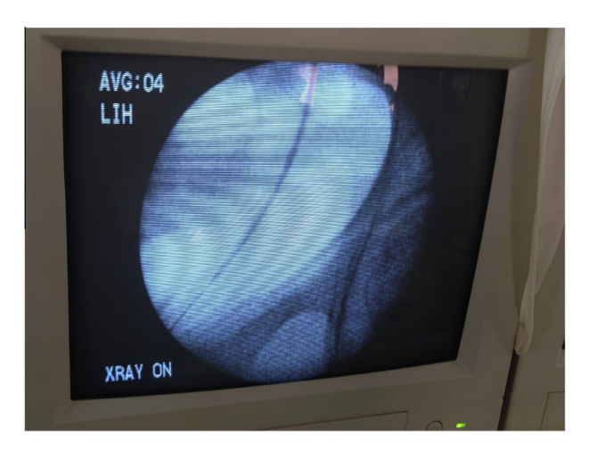
Figure 5 The stent being passed over the guidewire.