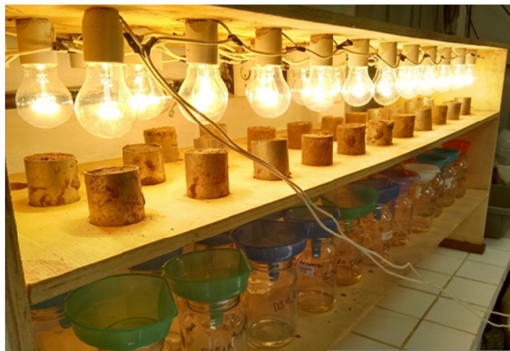
Figure 3. Rings with soil samples in the Berlese-Tullgren extractor

The specimens were identified in a Styrofoam box to minimize moisture losses and transported to LabNut, where they were placed in the modified Berlese-Tullgren apparatus for extraction of organisms (Figure 3). The rings were placed in the device were subjected to a light and heat source provided by 25 W lamps. With the heating of the soil sample for a period of 96 hours, the organisms present in the samples migrate to the lower layers of the rings, so as to leave the zone of intense heat, falling, later, in bottles of glass containing a solution of alcohol to 70%. To direct the fall of the organisms to the solution were placed funnels in part superior of the jars.