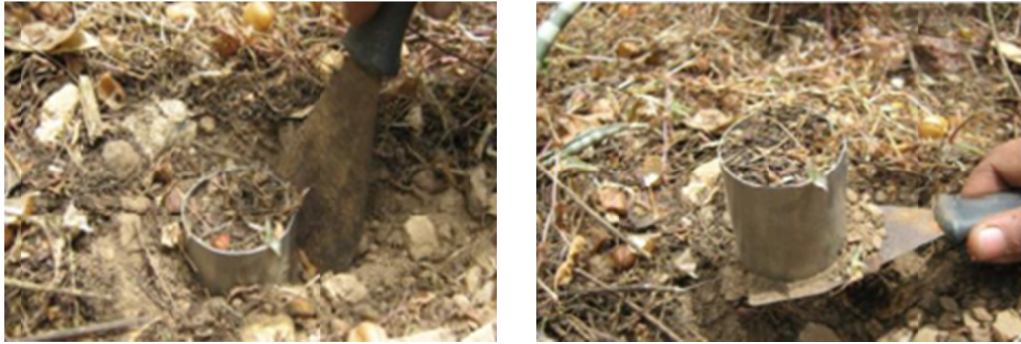
Figure 2. Collection of soil + litter samples in a fragment of Ciliary Forest in the Paraíba Semi-Arid, to extract the edaphic mesofauna using a metal ring

The specimens were identified in a Styrofoam box to minimize moisture losses and transported to LabNut, where they were placed in the modified Berlese-Tullgren apparatus for extraction of organisms (Figure 3). The rings were placed in the device were subjected to a light and heat source provided by 25 W lamps. With the heating of the soil sample for a period of 96 hours, the organisms present in the samples migrate to the lower layers of the rings, so as to leave the zone of intense heat, falling, later, in bottles of glass containing a solution of alcohol to 70%. To direct the fall of the organisms to the solution were placed funnels in part superior of the jars.