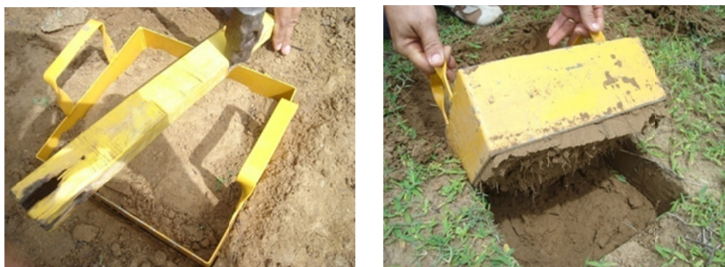
Figure 1. Collection of the edaphic macrofauna in a metallic frame in a Riparian Forest fragment in the Semi-arid of Paraíba

The soil fauna community in the study area was quantified and characterized by sampling at different times, with intervals of 15 days (March to May) in the rainy season in the region. For the sampling of the macrofauna (figure 1), it was carried out by TSBF (Tropical Soil Biology and Fertility), described by Anderson and Ingram (1993), modified. The dimensions of the monolith were 25.0 cm × 15.0 cm × 10.0 cm.