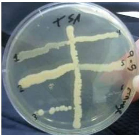
Figure 5. The effect of the incubated temperature on the antimicrobial activity of the strain 1 incubated at 30° C, for 24.

Test cultures (1): Bacillus spp. SQ41 (2): Serratia marcescens SQ22 (3): Streptococcus pyogenes SQ33 (4): Staphylococcus aureus SQ31 (5): Escherichia coli SQ21 (6): Staphylococcus epidermidis SQ32 +: showed antibiotic sensitivity.