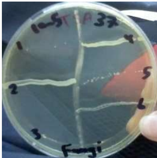
Figure 11. The effect of the incubated temperature on the antimicrobial activity of the strain 3 incubated at 37°C, for 24.