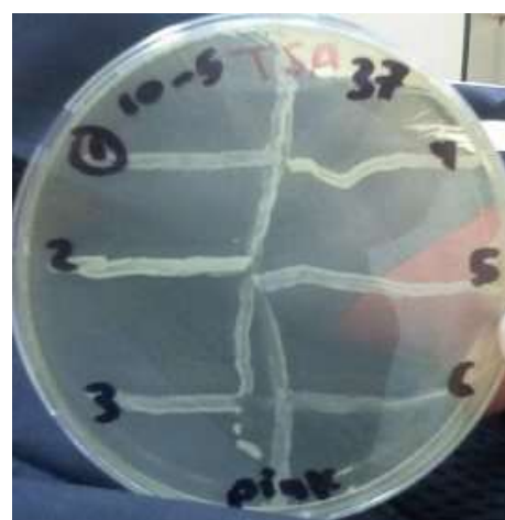
Figure 10. The effect of the incubated temperature on the antimicrobial activity of the strain 2 incubated at 37°C, for 24.

SQ32. Isolate 2 had an antimicrobial effect on Serratia marcescens SQ22 and S. epidermidis SQ32. Isolate 3 had an antimicrobial effect on Bacillus spp SQ41, Staphylococcus aureus SQ31, E. coli SQ21, Streptococcus pyogenes SQ33 and S. epidermidis SQ32. While isolate 4 had an antimicrobial effect on Bacillus spp SQ41, Streptococcus pyogenes SQ33 and S. epidermidis SQ32. A-4 isolated by Nanjwade et al. (2010a) showed broad spectrum of activity against both Gram-positive and Gram-negative organisms as well as antifungal activity. Three isolates (Ab18, Ab28 and Ab43) have shown high antagonistic activity against resistant pathogens, during the primary screening (Bizuye et al., 2013). As stated earlier, actinomycetes have provided many important bioactive compounds of high commercial