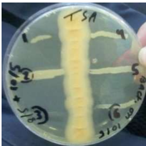
Figure 3. The antimicrobial activity of the isolate strain 3 on TSA.

Test microorganisms (1): Bacillus spp SQ41 (2): Serratia marcescens SQ22 (3): Streptococcus pyogenes SQ33 (4): Staphylococcus aureus SQ31 (5): Escherichia coli SQ21 (6): Staphylococcus epidermidis SQ32. +: showed antibiotic sensitivity.