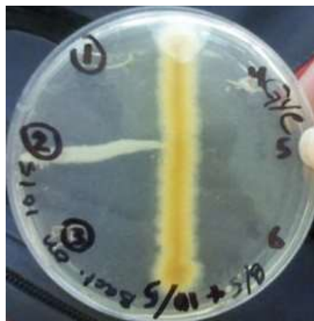
Figure 2. The antimicrobial activity of the isolate strain 3 on GYE.