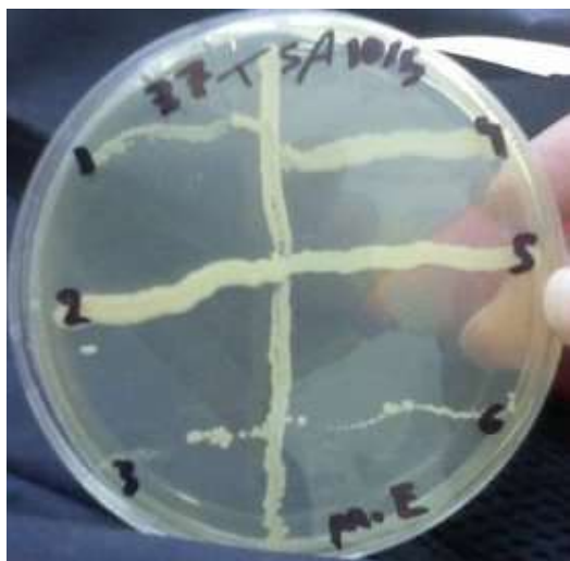
Figure 12. The effect of the incubated temperature on the antimicrobial activity of the strain 4 incubated at 37°C, for 24.

etc. Isolating and screening action myceters from such areas in optimum conditions may contribute to the discovery of new antibiotics (Bizuye et al., 2013).