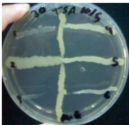
Figure 8. The effect of the incubated temperature on the antimicrobial activity of the strain 4 incubated at 30°C, for 24.