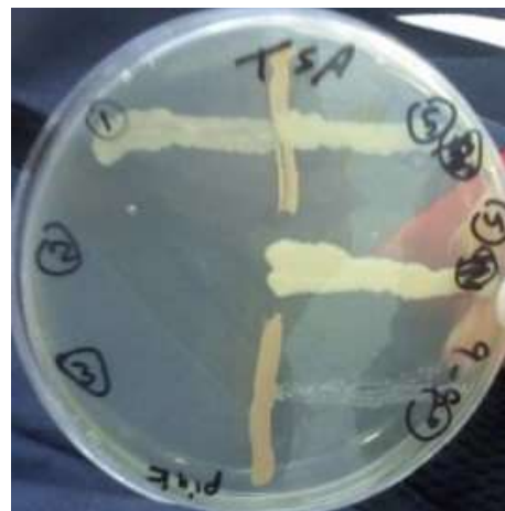
Figure 6. The effect of the incubated temperature on the antimicrobial activity of the strain 2 incubated at 30°C, for 24.

which had no significance in the isolation process. The presence of relatively large populations of actinomycetes in the soil samples of Alba'qa region indicates that it is a suitable ecosystem that promotes the isolation of actinomycetes during screening programmes.