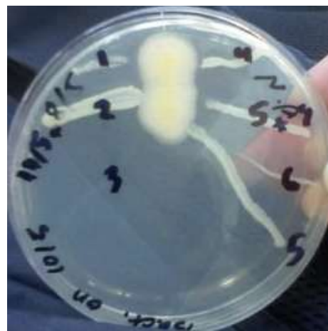
Figure 4. The antimicrobial activity of the isolate 3 on NA.