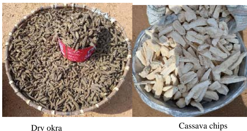
Fig. 2. Biological materials of study