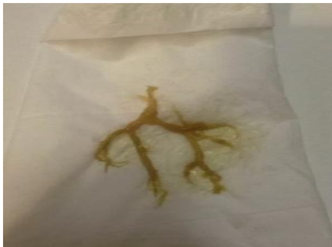
Fig. 4. Bronchial casts