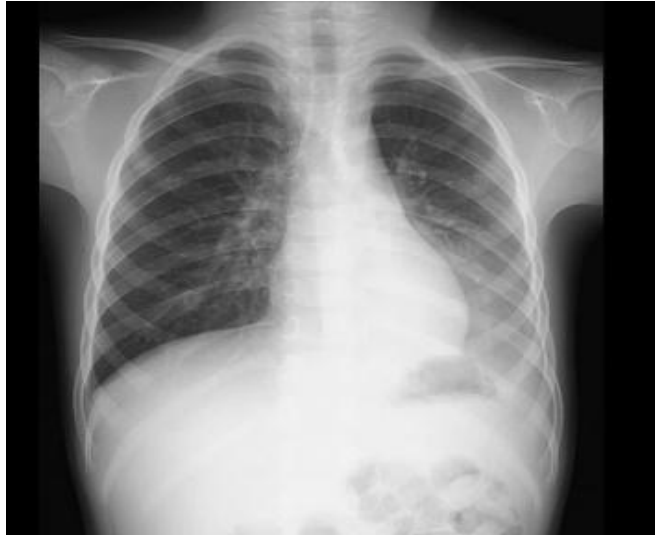
Fig. 2. Result of chest X-ray after bronchoscopy: The pulmonary pattern has returned to normal