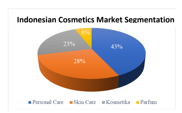
Fig. 1. Indonesian cosmetics market segmentation

Similar conditions also occur in Indonesia. Quoted from www.statista.com, as part of the Asian market, the Indonesian cosmetic industry is predicted to reach USD 7.5 billion in 2021, and will be through a growth of 6.5% until 2025. The prediction of the cosmetics business market is still dominated by the personal care segment which will reach 3.2 Billion USD or about 43%. Next is skin care products; 2.1 Billion USD, cosmetics; 1.7 Billion USD; and perfume; 0.4 Billion USD. In general, the segmentation of the Indonesian cosmetics market can be depicted in the image below.