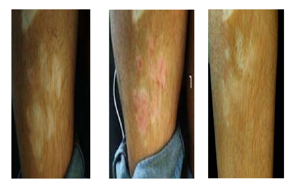
Fig. 2. A 26-years-old male with vitiligo in extremities (A); before treatment (B); Immediately after treatment session (C); 3 months after last session with good improvement

All studied patients tolerated the treatment well. The adversereactions were minimal and transient in the form of burning sensation, inflammationat site of microneedling that disappeared spontaneously within few hours. On the other hand, recurrence was observedin15% of the studied patients (3 patients) after 3 month from last session.