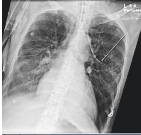
FIGURE 1: Single frontal view CXR showing the tip of the left IJ CVL extending left of the aortic arch towards the left lung field.