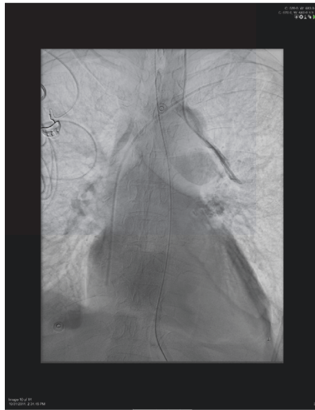
FIGURE 2: Fluoroscopy study showing left IJ CVL extending through the anomalous pulmonary vein.

proper catheter placement in the left IJ. A pressure transducer was connected which showed a venous wave form with a pressure of 10 mmHg. ABG obtained from the catheter on continuous mechanical ventilation ( \text{FiO}_2 = 50\% , positive end expiratory pressure = 5 CM \text{H}_2\text{O} ) showed \text{PaO}_2 of 102 mmHg compared to 79 mmHg from radial arterial site. A transthoracic echocardiography, which was done to evaluate cardiac function, did not show evidence of atrial septal defect or any other cardiac malformation. Fluoroscopy study was used to place a left peripherally inserted central catheter (PICC) and to confirm the location of the left IJ CVL which demonstrated contrast injection in an anomalous pulmonary vein (Figure 2). We concluded that the patient has partial anomalous pulmonary venous return (PAPVR) and the left IJ CVL was removed. The PICC line was used instead for central access.