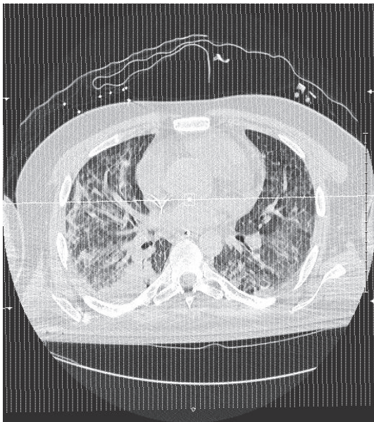
FIGURE 2: Chest CT scan.

IV: intravenous, H: hours, day since exposure to smoke.