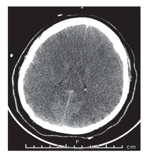
FIGURE 1: Noncontrast head computed tomography (CT) showing diffuse sulcal effacement and obliterated basal cisterns.